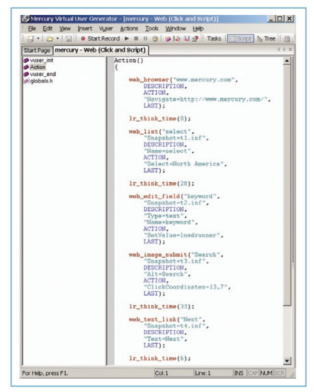
Click and Script Technology utilizes a very succinct scripting language.